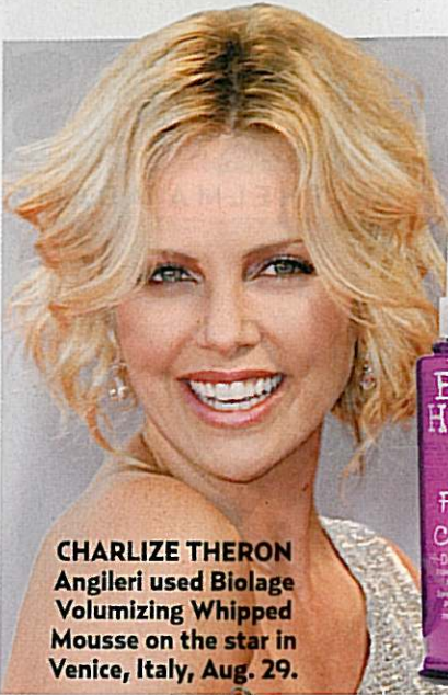
CHARLIZE THERON Angileri used Biolage Volumizing Whipped Mousse on the star in Venice, Italy, Aug. 29.