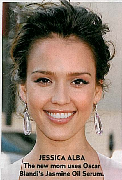
JESSICA ALBA The new mom uses Oscar Blandi's Jasmine Oil Serum.