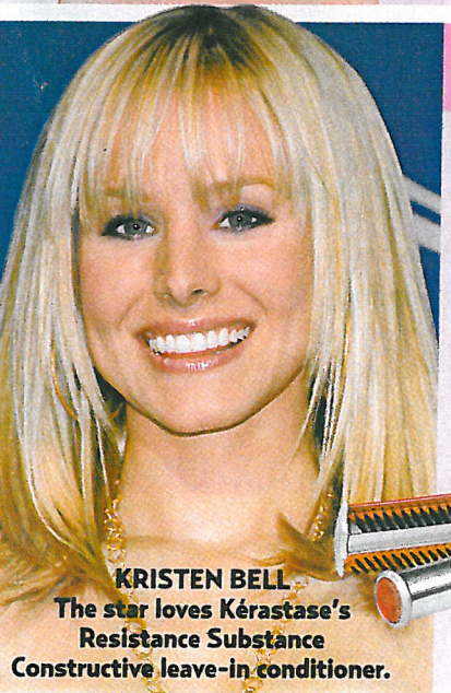
KRISTEN BELL The star loves Kérastase's Resistance Substance Constructive leave-in conditioner.