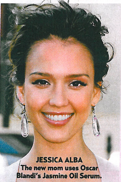
JESSICA ALBA The new mom uses Oscar Blandi's Jasmine Oil Serum.