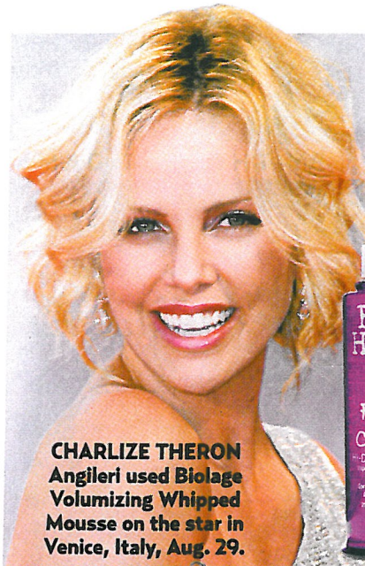
CHARLIZE THERON Angileri used Biolage Volumizing Whipped Mousse on the star in Venice, Italy, Aug. 29.